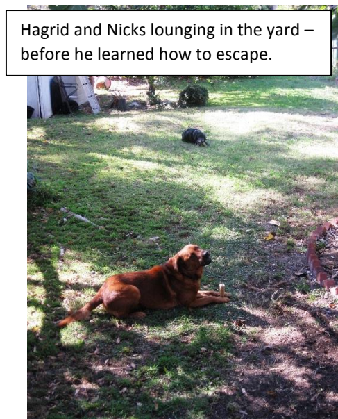
Hagrid and Nicks lounging in the yard – before he learned how to escape.