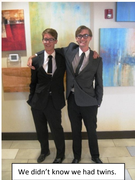
We didn't know we had twins.