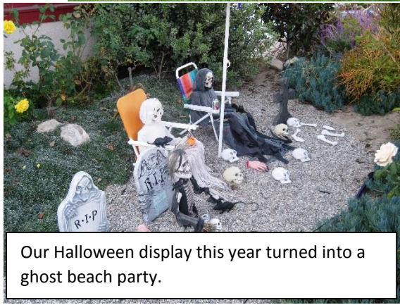
Our Halloween display this year turned into a ghost beach party.