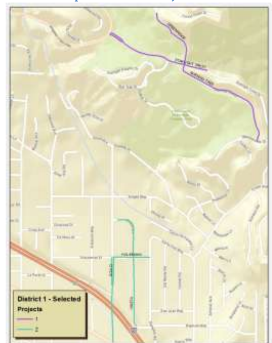
Map 5 - Possible Project Sites

With a sight selected, I was then able to create a project area. Based upon my conversations with my counterparts in the public works department, I was aware that the proximity of one site to another is an important factor, as it can help to minimize the overall costs of a capital improvement project. With this factor in mind, I used the “Select by Feature” function to find other street segments that required street resurfacing located within a 500-foot radius of each