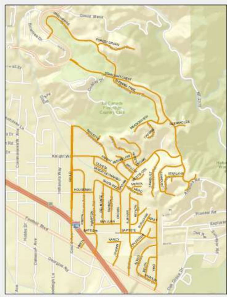
Map 1 - District 1

Due to the large amount of data processing involved throughout the course of this project and the time constraints in place, I unfortunately had to narrow my scope to a small section of La Cañada Flintridge. I focused on the area that the county has labeled District 1, which is bounded by Foothill Boulevard to the South, Gould Avenue to the West, and city boundaries to the North and East (see Map 1 to the left).