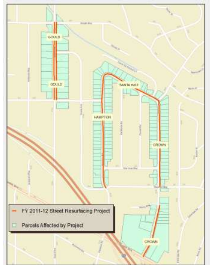
Map 2 - Fiscal Year 2011-12 Street Resurfacing Project

To create this map, I first used the “Select by Feature” query to isolate the street segments within District 1 that have a score of 100 on the County’s pavement condition index. According to the pavement condition report (Pavement Management Unit, 2012, p. 3), this score symbolizes “a brand new pavement in excellent condition”. Such a score makes perfect sense considering that the evaluation occurred directly after the FY 2011-12 street resurfacing project completed. Once the street segments with this score were selected, I then exported the records to a separate map layer. This new map layer became the source records for a “Select by Location” query of all parcels within 50 feet. I performed this query in order to select and isolate the parcels located directly adjacent to the recently resurfaced street segments. Once selected, I exported the records for these parcels