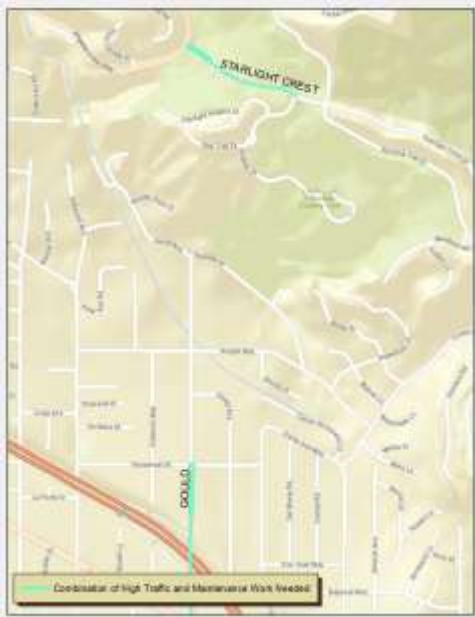
Map 4 - High Traffic & Maintenance Needed

conversations with the public works staff, there was little interest in attempting to look at records of past capital improvement projects. Instead, public works staff was most interested in attempting to maintain or improve service levels in some manner. As a result, I attempted to create a suitability map that would target the more heavily trafficked segments of street in District 1, which also have low enough pavement condition index scores that maintenance work is required. I did this by first creating a shapefile of all streets with traffic counts. This shapefile also contained records on the pavement condition index