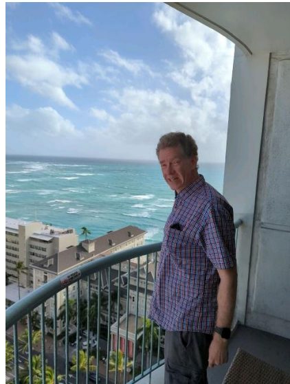
Welcome to Waikiki Beach!