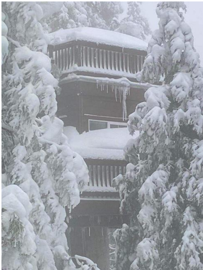
A LOT of snow on the treehouse at the cabin